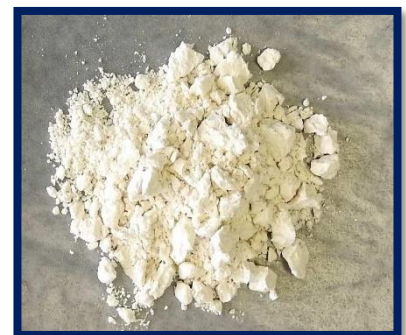
Cuyahoga County Corner Office